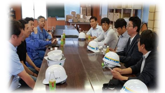
Business arrange meeting service