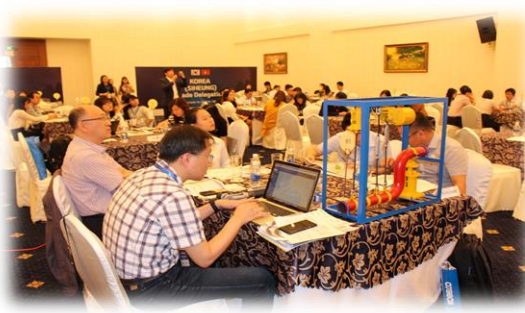
Korea Delegation service program