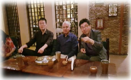
Business arrange meeting service