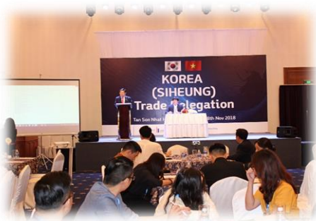
Korea Delegation service program